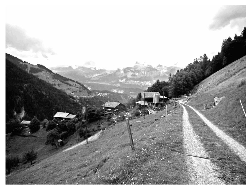
Much of what happened in European cities escaped Switzerland's rural families, living in rugged isolation as on this farm above Bonaduz in the Grisons. As they had welcomed Waldensian messengers throughout many generations, they welcomed Anabaptist teachings in the 16'th Century.