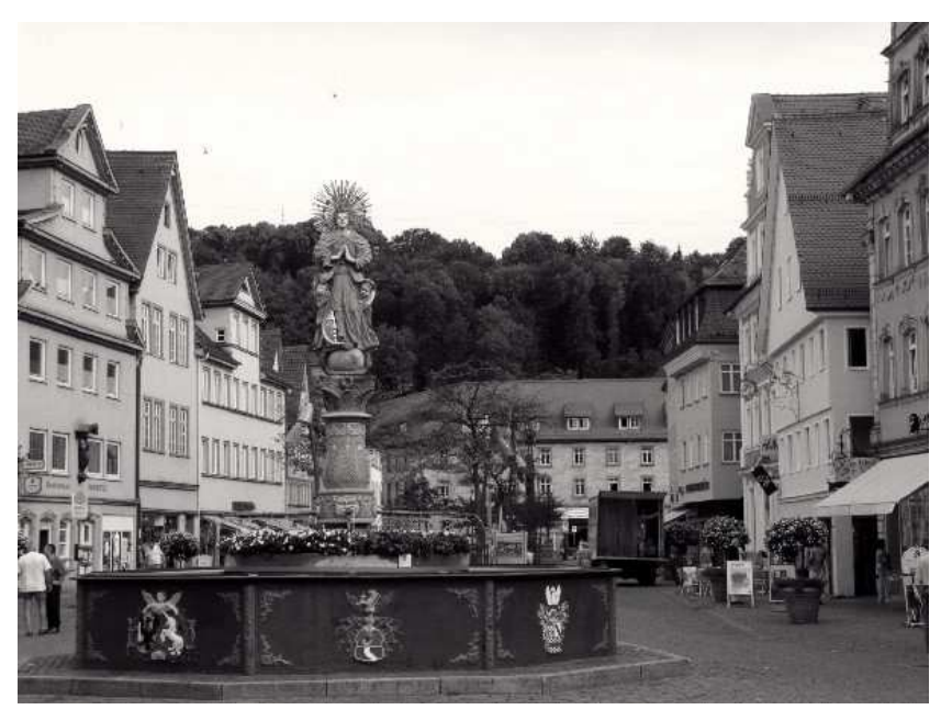
The Marienbrunnen (fountain of Mary) in the market place at Schwäbisch-Gmünd, whose miraculous benefits the Anabaptists disowned.

His voice above the sound of the drums was clear, and many could understand what he said: "Stand off from your sins! Turn to God! There is no other way to heaven than through the Lord Jesus Christ who died on the cross to redeem us!"