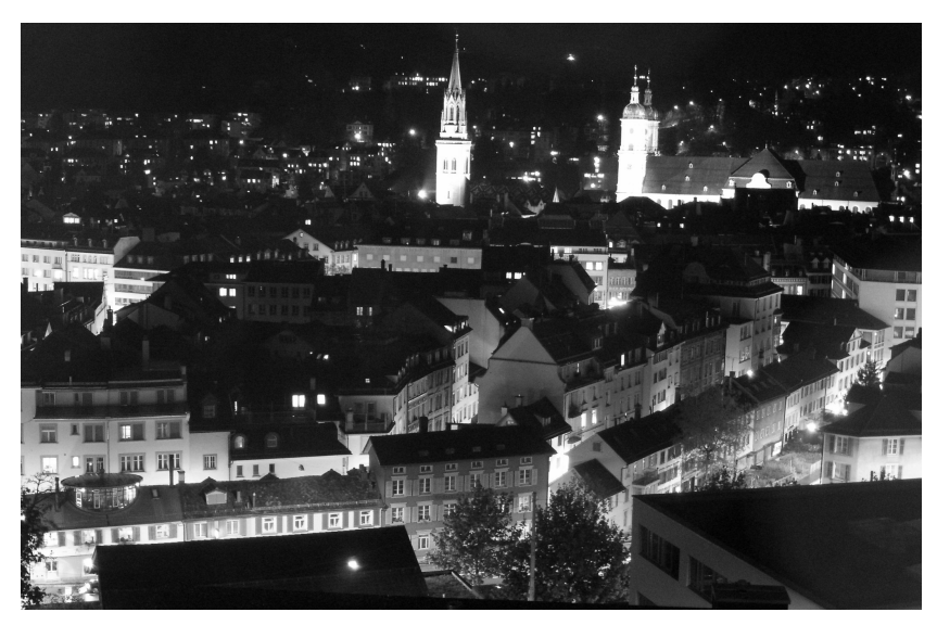
Sankt Gallen, the city that grew up around its famous monastery (the monks' twin-towered chapel illuminated on the right) eagerly embraced Reformation ideas. But to go the whole way, to follow Christ and get baptised as believers, seemed far too radical for most of its people in the sixteenth century.

was raised from the dead through the glory of the Father, we too may live a new life."