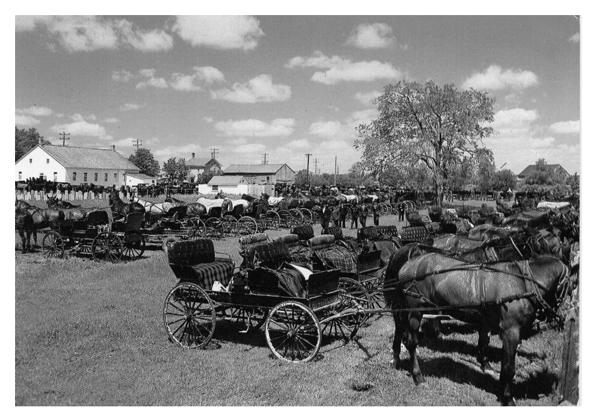
Two scenes from my home area, in the Waterloo Region, Ontario, Canada. An Old Order Mennonite meetinghouse (above) and the sign announcing a Canada Day picnic at an Ontario Conference Mennonite church (facing page).

past while peering anxiously at the new land that lies before us. Some of us rejoice. Others weep. We face an uncertain future. Do we have what we need?