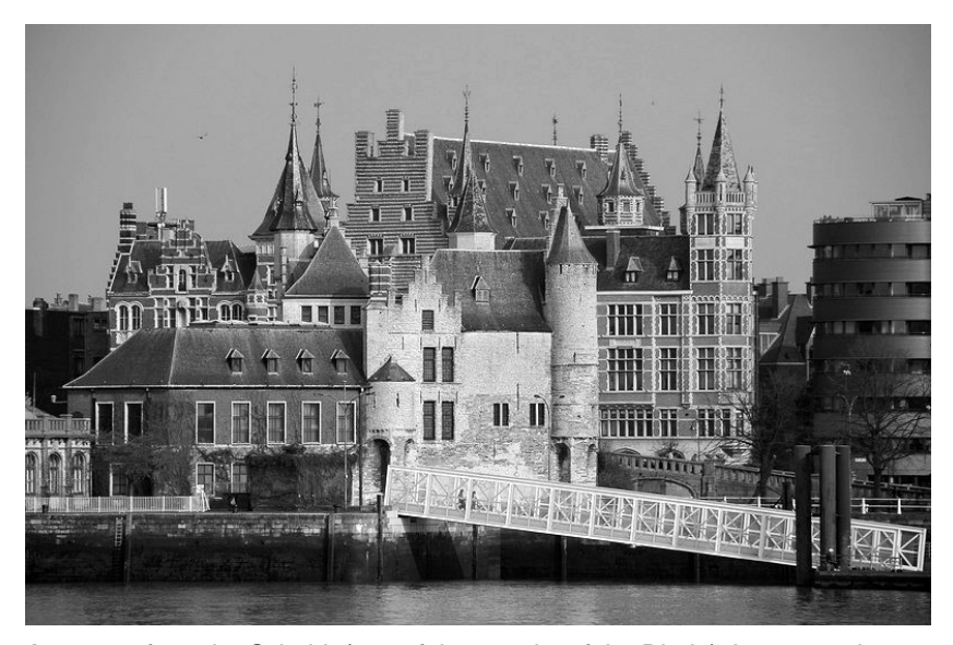
Antwerp, from the Scheldt (one of the mouths of the Rhein), home to a large "underground" fellowship of believers in the 16'th century. Many Anabaptist prisoners, including Lauwerens van der Leyen, lay in chains in Het Steen castle, centre foreground.

They beheaded Lauwerens at Antwerp in Belgium on November 9, 1559. 10