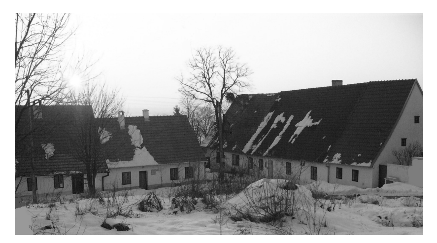
Communal dwellings at Velké Leváre (Großschützen), in Slovakia, still standing nearly five centuries after their construction by Anabaptist believers (Hutterites) who in Eastern Europe became known as Habáni from their life in the Haushaben (places where they all lived, ate, and worked together).

of much warfare, and are still so today. Where do war and bloodshed come from? Where do contention and strife come from? Why is there so much disunity and division? All these things come from the desire for property and for claiming things as one's own.