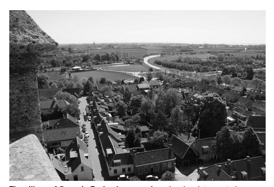
The village of Goes, in Zeeland, as seen from the church tower, today. they came out at the ankles. But his heart could not be moved. Then the court convicted him and sentenced him to death.

They made a little house of straw on the town square. The people came by boat, on horseback, and on foot to see. They lined the streets and the sides of the square, surrounded by soldiers to hold them back... and waited.